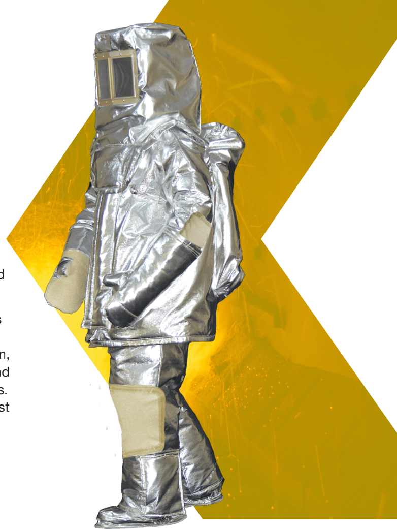
*Suit May Vary Slightly from the Image Above

This suit is intended for use in oven and kiln maintenance and can be used in a wide range of industries in which workers are exposed to extreme temperatures.